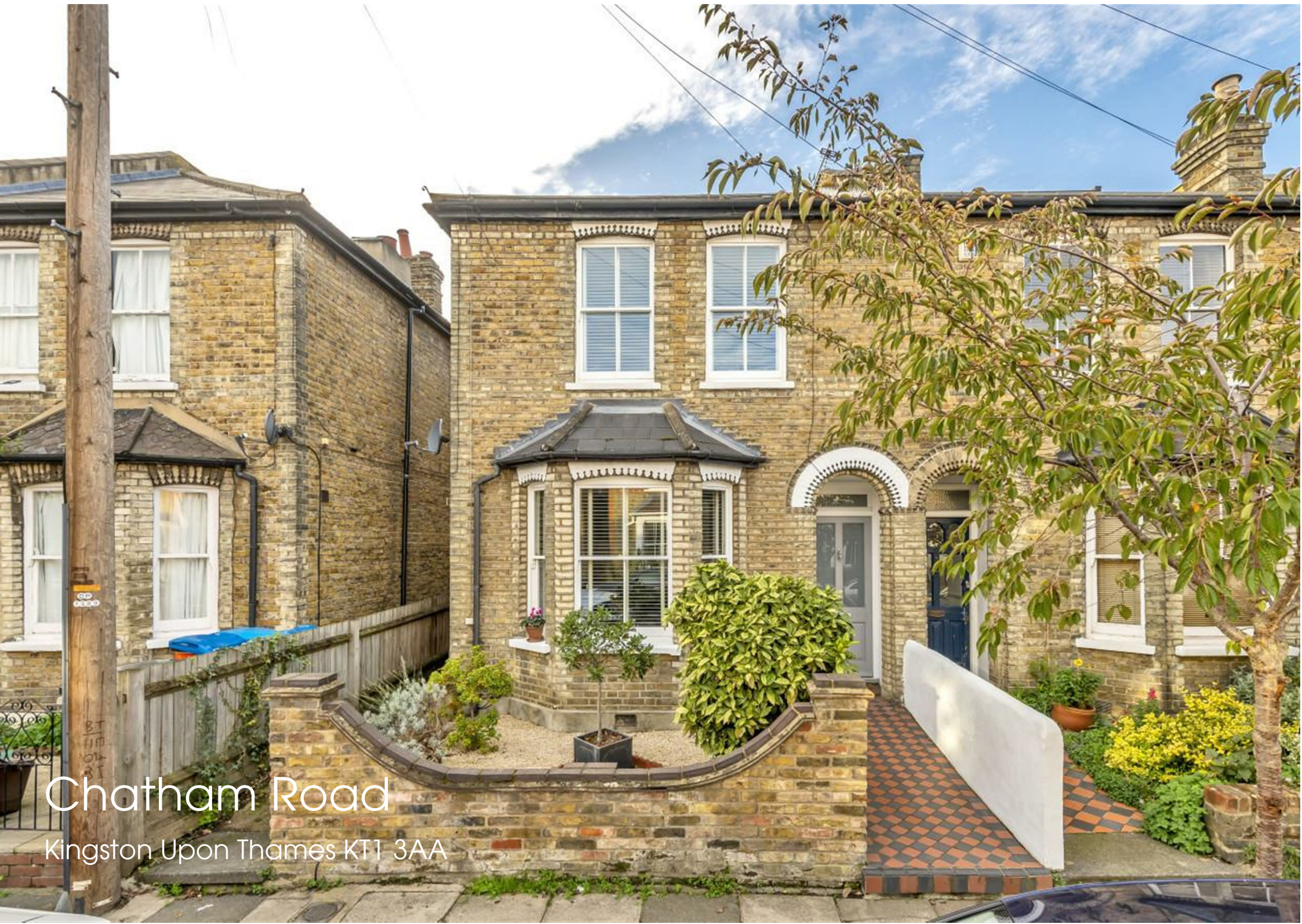
Chatham Road Kingston Upon Thames KT1 3AA